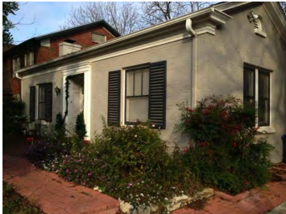
The radiant barrier fits within the attic, not visible from the exterior