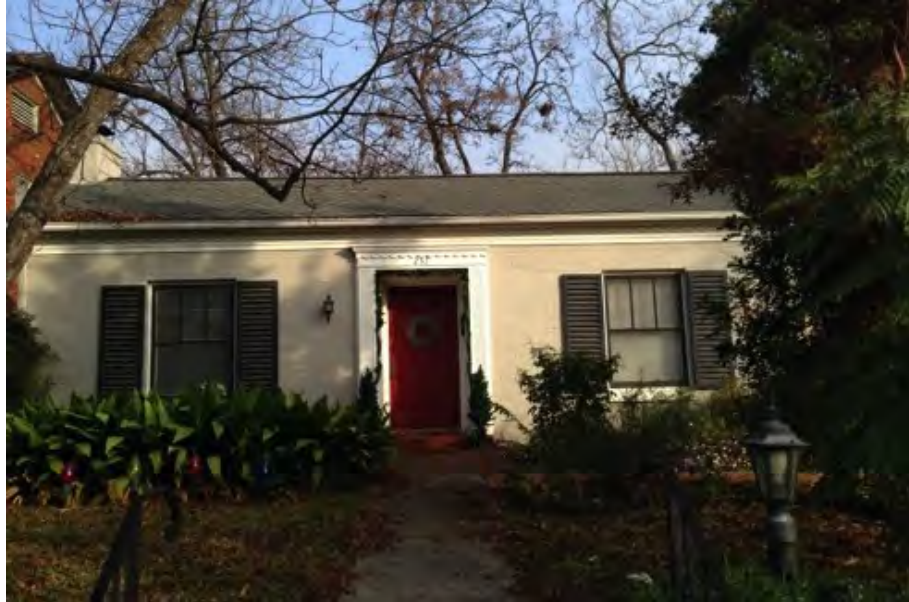
Exterior of RTA 8