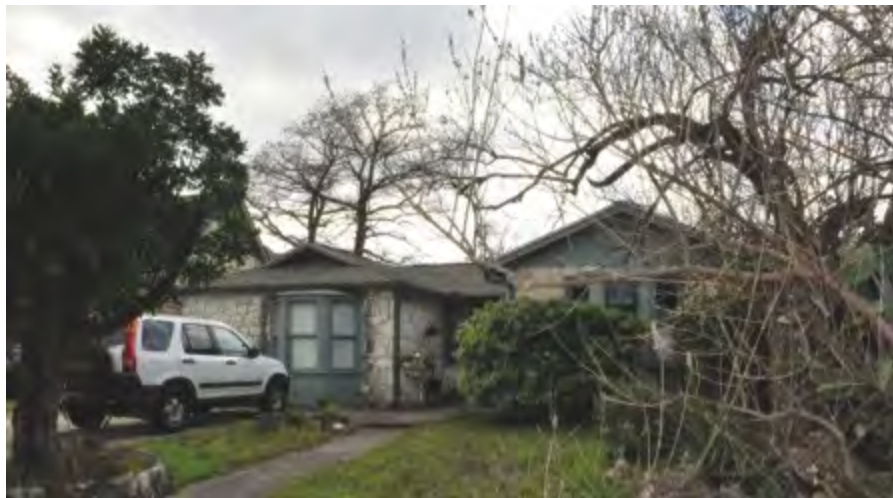
Exterior of RTA 5

As discussed above, only one home, RTA 5, had any other retrofits installed during the monitoring period. In this home, ceiling (the attic “floor”) insulation was added at the same time as the radiant barrier retrofit. Based on this, it was assumed that differences between pre- and post- energy use will represent the impact of the radiant barrier after accounting for weather differences and non-heating and cooling energy use. As expected, this home showed the highest reduction in cooling EUI (approximately 20%). However, it did not significantly exceed the reductions achieved in other homes. This could be the result of behavioral changes between the pre- and post-installation periods.