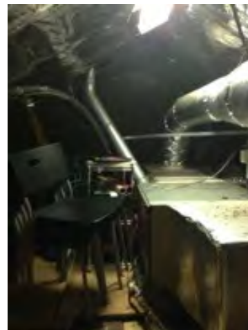
Exterior and attic of RTA 7