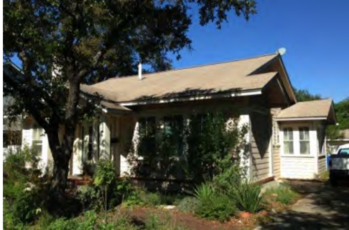
Exteriors of RTA 9 (left) and RTA 11 (below).